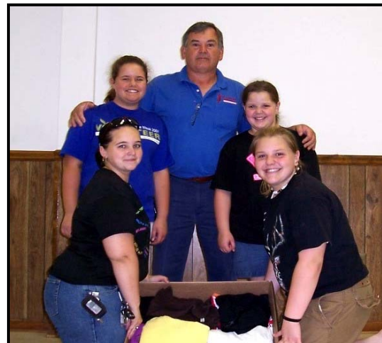
Wheeler County 4-H Disaster Relief Bank Project $200