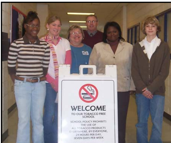
Tobacco Youth Prevention Grant to Lamar County 4-H $1,000