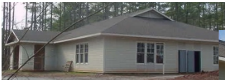
WILDLIFE ECOLOGY BUILDING FUNDED BY FRIEND OF 4-H COMPLETION DATE MAY 1, 2002