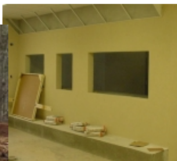
LAKE ECOLOGY LABS FUNDED BY WOODRUFF FOUNDATION COMPLETION DATE 2002