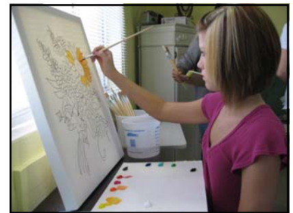
A 4-Her practices on canvas prior to trying out her design on the wall.

Johnson County 4-H has recently received several grants, including a Grassroots Arts Grant, which was used for Johnson County 4-Hers to paint a beautiful garden mural on the walls of the Alzheimer's Community room at the Wrightsville Nursing Home. Students not only had the opportunity to interact with the elderly patients at the home, but were also able to "brush up" on their painting skills! The Grassroots funding, which is appropriated by the Georgia General Assembly, supports arts programs and services throughout the state.