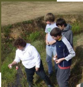
"Paulding County 4-H Stream Team" Captain Planet $400