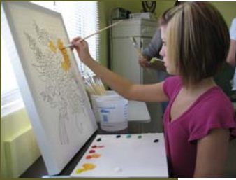
Johnson County 4-H Washington EMC Operation Round-up $1900

Increases have resulted from a variety of reasons such as higher numbers of grant applications and greater understanding of the grant process through diversified training strategies. This fiscal year 58 grant applications were recorded, as compared to 43 in FY 07-08, and 36 in FY 06-07.