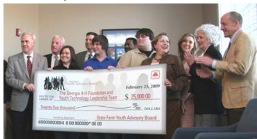
$25,000 State Farm Youth Advisory Board

in the UGA program of adult education and former state leader in Minnesota and Michigan Extension. "Its people will continue to be passionate about