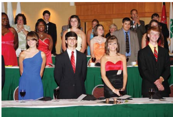
Nearly 150 state winners in projects and special events were honored at the Georgia 4-H State Congress Georgia EMC annual banquet