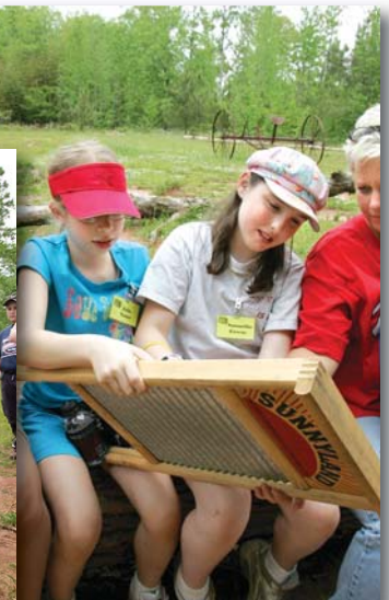
Students in pioneer tools class while on an environmental education field trip at Rock Eagle 4-H Center