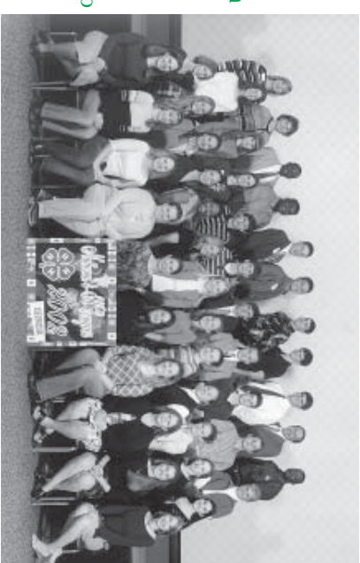
Georgia Delegates to National 4-H Congress

Over the Thanksgiving holiday weekend of 2002, more than 1,200 delegates from throughout the nation converged in Atlanta to participate in the 81 st National 4-H Congress. Georgia 4-H was represented by 42 delegates who were state winners in projects.