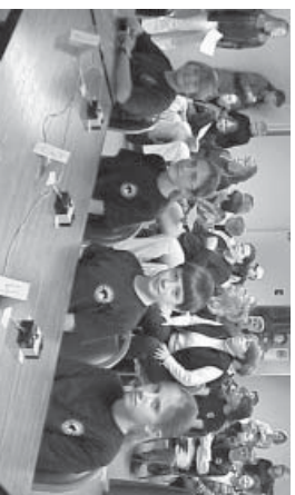
Wayne County Junior Team

The 2003 4-H Horse Quiz Bowl season officially began in Tifton on Saturday, January 4. Horse Quiz Bowl is a competitive event that tests 4-H members' knowledge of equine-related subject matter. Junior and Senior 4-H'ers are eligible to form teams for the contest. 4-H Horse Quiz Bowl is an excellent opportunity for 4-H'ers who are interested in horses, but are not able to own one. The program continues to grow in participation each year.