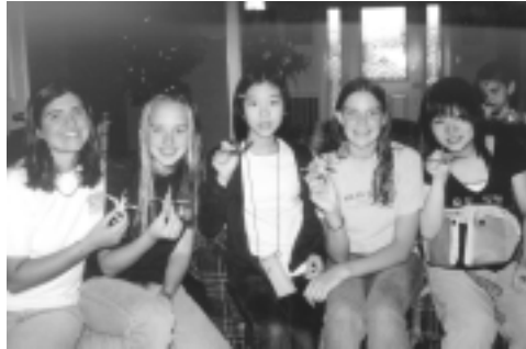
Japanese exchange students in Madison Co. show a 4-H host sibling (2nd from left) and her friends how to make origami birds. The summer LABO program usually runs about a month from late July to August.

LABO also has two other exchange programs: a year-long program for