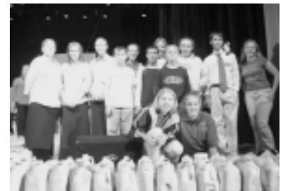
Above: Junior 4-H'ers collected over 5,400 lbs. of “pop-tops,” which amounted to a donation of $1,907 for the Ronald McDonald House.