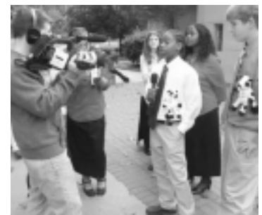
Below: A 4-H'er participates in the making of a new promotional video for Georgia 4-H.