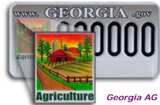
Georgia AG TAG