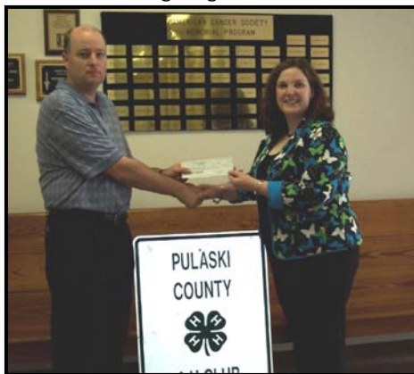
Ocmulgee EMC Operation Round-up