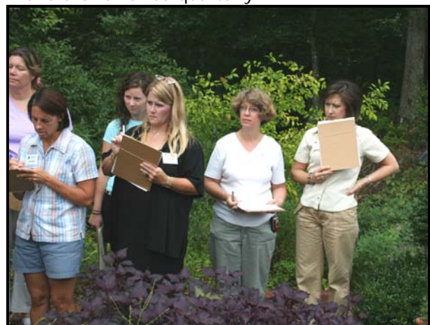
4-H Staff Training for GEN

Deadline: Applications can be filled out online, and are reviewed quarterly.